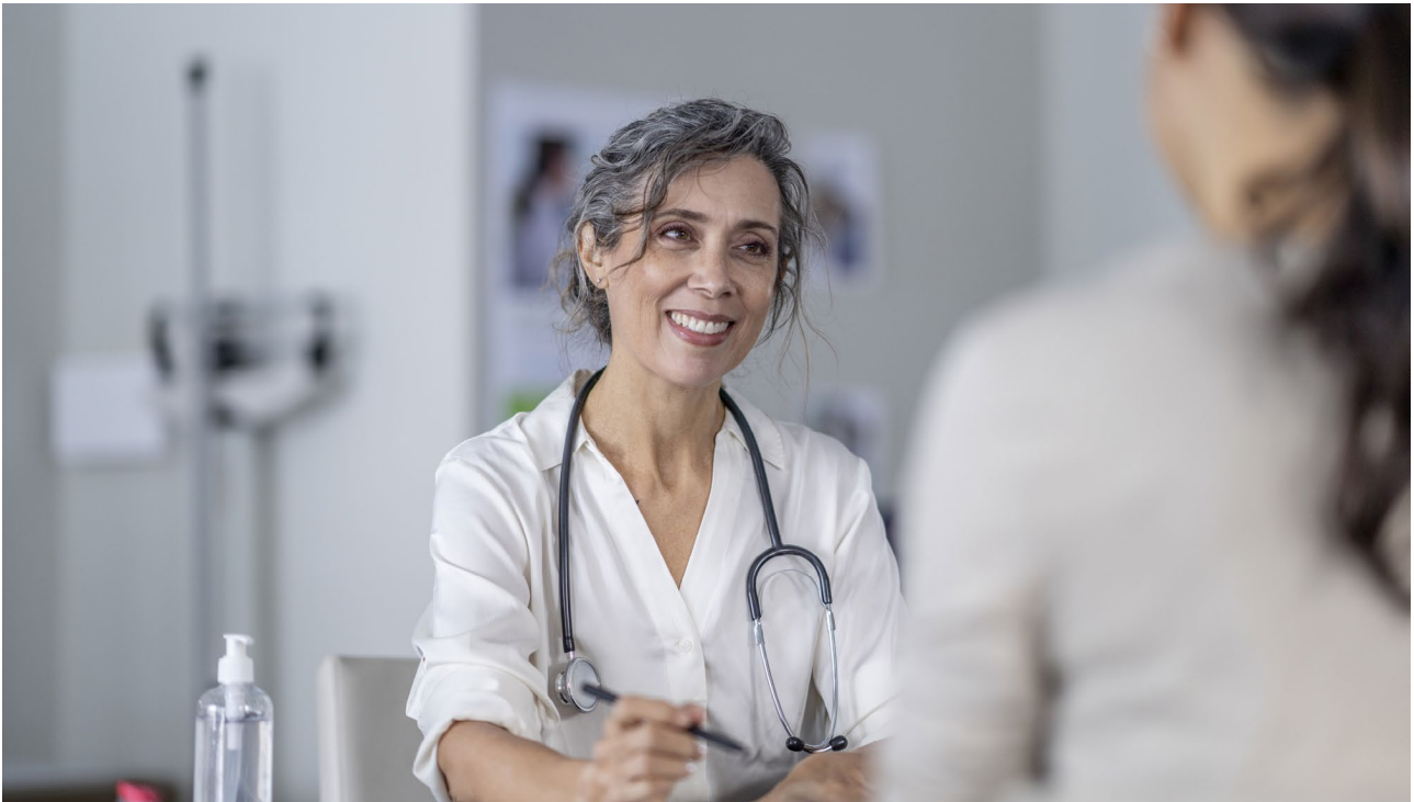
Generic medical image